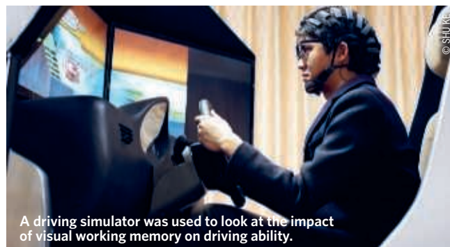
A driving simulator was used to look at the impact of visual working memory on driving ability.

Yet, the crux of WM — the dynamic processing of information, is often ignored. Shen