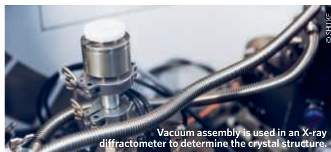
Vacuum assembly is used in an X-ray diffractometer to determine the crystal structure.

The crystalline structure of this material is quasi-one-dimensional. It contains double-walled sub-nanotubes with an outer diameter of around 0.58 nm, which are separated by alkali metal ions. The material bears significantly strong electron correlations, shown by a large electronic specific-heat coefficient. Experiments revealed that below 6.1 Kelvin (around -267.1^\circ\text{C} ), electrical resistance